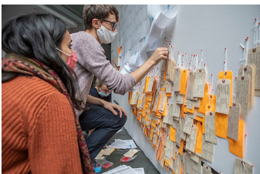
write paint weave draw build...